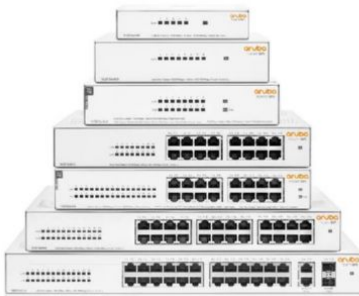
Aruba Instant On 1430 Switch Series Family

The Aruba Instant On 1430 Switch Series includes seven switches in PoE and non-PoE configurations: one (1) 5-port, two (2) 8-port, two (2) 16-port, one (1) 24-port, and one (1) 26-port model with 2 SFP uplinks models. With the PoE models, you get up to 30W PoE per port power delivery for Class 4 PoE devices like access points, surveillance cameras and VoIP phones. The 8-port and 16-port PoE models come with the power budget of 64W and 124W respectively to support the latest IoT devices. All switches are fan-less, making them ideal for acoustically sensitive areas, and unmanaged requiring no configuration (not managed by Aruba Instant On management).